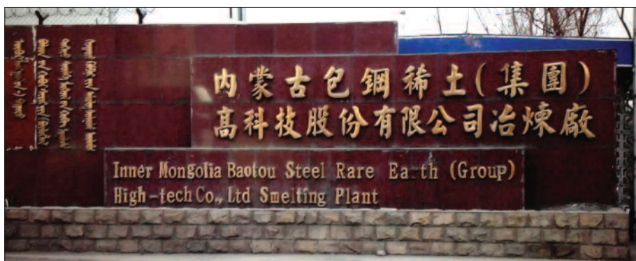
Figure 5. The entrance to the largest producer of rare earths, the Inner Mongolia Baotou plant, 8 km west of Baotou city center. The huge industrial complex is 560 km west of Beijing and can be identified on Google maps centered at N40° 39.38 E109° 44.70. Originally a steel production plant, Baotou Company entered the rare earth business in 1958. This rolling steppe was once a vast, beautiful grassland, but now is a toxic wasteland with atmospheric coal dust and sulfuric acid, and an infamous sludge lake clearly visible on Google maps (N40° 38.22 E109° 41.33). By the 1980s, leakage from the toxic lake (including thorium discharge into the Yellow River) was damaging five surrounding villages, resulting in their complete removal. 4

displays (yttrium, europium, terbium), hybrid batteries (lanthanum), and electronic devices (gadolinium). A classic laboratory example of the unique properties of rare earths is the unusual Curie point of metallic gadolinium (Figure 2).