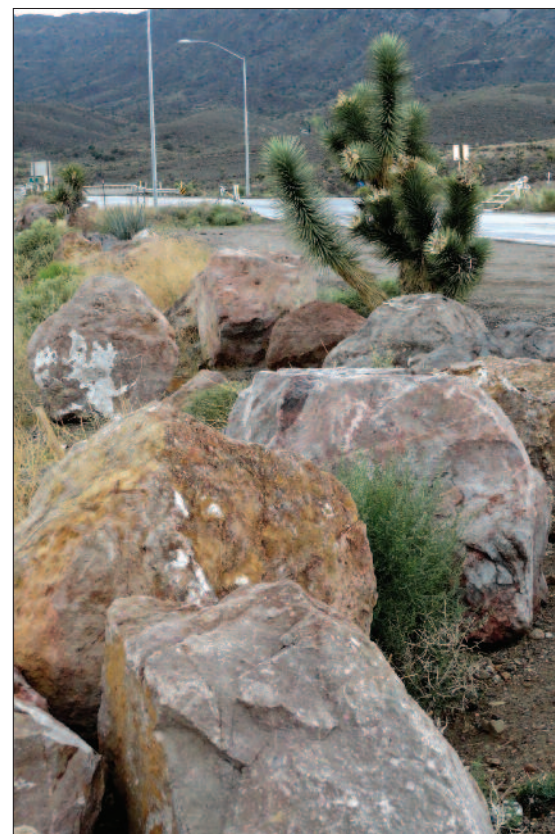
Figure 4. These are bastnäsite boulders lining the entrance road to MolyCorp—the stones appear as reddish (RE)CO 3 F crystals in a white matrix of calcite, dolomite, and barite. A check with a Geiger counter proved they were slightly radioactive, typical for a rare earth mineral. The composition for Mountain Pass bastnäsite is variable, but a rich sample procured by the authors showed a content (RE%) of La 32%, Ce 49%, Pr 4%, Nd 14%, Sm 0.5%, Gd 0.3%, Eu 0.1%, with ppm quantities of the remaining lanthanides (except promethium) and Sc and Y.

The major ore of the Mountain Pass mine is bastnäsite, a mineral with the formula (RE)(CO) 3 F, where RE = rare earth (Figure 4). Geologically speaking, bastnäsite is not a "carbonate," which is laid down by a sedimentary process, commonly of organic origin, e.g., limestone, CaCO 3 . Instead, the mineral is a "carbonatite," an igneous mineral produced in carbon dioxide-rich magmas. 2 Rare earth carbonatites are typically formed deep in the upper mantle, from which they are later uplifted to the surface of the earth. The process creating such surface exposures of rare earth carbonatites is quite