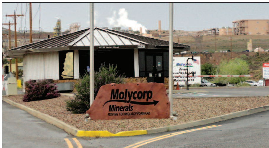
Figure 3. The entrance to MolyCorp, Inc.'s, Mountain Pass mine, CA (N35° 28.35 W115° 31.70). The view is north; the rim of the open-pit mine is on the horizon. (See the cover for an aerial view of the mine).