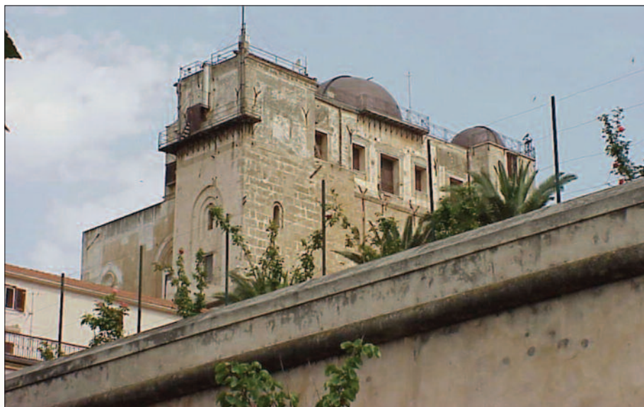
Figure 12. The dwarf planet (asteroid) Ceres was discovered in 1801 by Giuseppe Piazzi, Catholic priest, mathematician, and astronomer (1746–1826), at the observatory he established in Palermo, Italy, at the Palazzo dei Normanni (Norman Palace) at Piazza del Parlamento, running south from Via Vittorio Emanuele (N38° 06.69 E13° 21.17). Coincidentally, the element technetium was discovered 1.7 km to the east in 1937, at the previous Institute of Experimental Physics (Royale Istituto di Fisica Sperimentale), Via Archirafi 36 (N38° 06.61 E13° 22.39), by Emilio Segrè (1905–1989) and Carlo Perrier (1886–1948). 31

giving rise to minerals such as gadolinite or xenotime, rich in yttrium and the heavy rare earths. The “light” rare earths are more commonly found in bastnäsite or monazite. Scandium, with a smaller radius of 0.088 Å tends to be an outlier and can occur also in specialized minerals, such as euxenite, a radioactive niobate-tantalite.