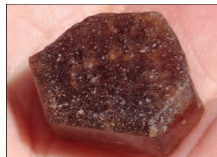
Figure 14. This gemmy crystal of bastnäsite , measuring 10 mm across, is hexagonal, resembling a ruby; while simultaneously it appears as translucent coffee-colored, very much like a garnet. This crystal analyzed by EDX to give 26% La, 29% Ce, 6% Nd, and lesser amounts of Pr, Sm, Eu, and Gd. From the private collection of the authors.

Mosander also made a careful study of yttrium, obtained from the Ytterby Mine. Again alerted by colored solutions of its salts, in 1842 he undertook its fractional crystallization. From ammonium hydroxide solutions he obtained three fractions: the first fraction yielded a dark orange oxide of an element he named erbium ; the second a rose-colored oxide of another element he named terbium ; and the last a white oxide of the parent yttrium. 9b He could accomplish the same task by fractional crystallization of the oxalates. [Note: in 1877 the original names of "erbium" and "terbium" were reversed 9b —today erbium oxide is used to produce pink ceramics and jewelry]. His results were confirmed by Berzelius, who went on to find that Gadolin's mineral (gadolinite, in which he found yttrium) also held cerium.