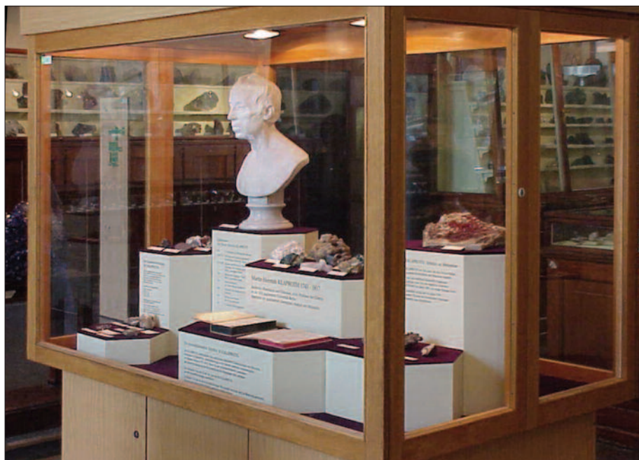
Figure 13. Martin Heinrich Klaproth (1743–1817) 3f was codiscoverer of cerium. This exhibit at the Berlin Museum für Naturkunst (Museum of Natural History; Invalidenstrasse 43; N52° 31.79 E13° 22.78) displays authentic samples of the minerals from which he discovered/co-discovered eight elements, including cerium, beryllium, titanium, chromium, strontium, zirconium, tellurium, and uranium. Always a modest and unambitious gentleman, he often gave credit to others when in fact it was his splendid research that confirmed a discovery.

The observant and cautious Mosander noticed that some of his lanthanum fractions were amethyst-colored, and he suspected yet another new element. In 1840, he heated a solution of lanthanide sulfate, thereby observing a precipitate of amethyst-colored crystals (it was known by then that cerous and lanthanum salts exhibit retrograde solubility, where salts are more sol-