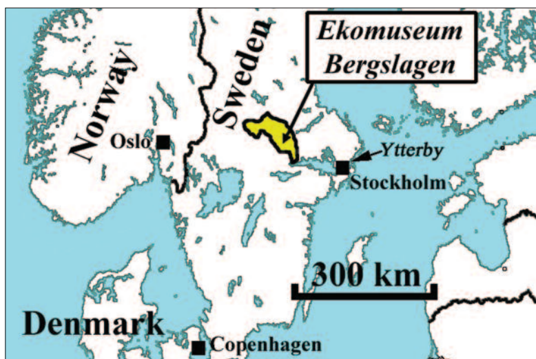
Figure 6. The two discovery sites of the first two rare earths (yttrium and cerium) were respectively the Ytterby Mine 2c near Stockholm, and the Bastnäs Mine near Riddarhyttan in the Ekomuseum Bergslagen, a region in the center of Sweden containing several national heritage sites.

Figure 7. The Ytterby mine (N59° 25.60 E18° 21.18) has been closed off, but the surrounding rock facing (right) is typical of the pegmatite geology of the area. Pegmatites have the same composition as granite—quartz, feldspar, and mica—but the crystals are larger (left). In pegmatite outcroppings in Sweden, frequently other minerals are found, such as the gadolinite (left) in which yttrium was originally found. Historically, the quartz and feldspar were mined for the porcelain industry. Directions to reach this mine have been previously published in the 2008 Spring HEXAGON. 3*