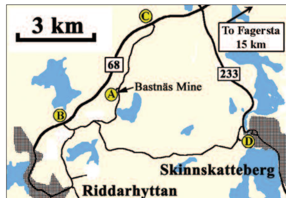
Figure 8. This map describes how to reach the Bastnäs Mine. The Swedish government wishes to leave the countryside pristine and convenient highway signs are not posted to guide the traveler. The Mine itself (A) is located at N59° 50.75 E15° 35.34. One enters the mine road off Highway 68 (which leads north from Riddarhyttan) at either B (N59° 49.99 E15° 32.99) or C (N59° 52.06 E15° 36.86). The historic Hisinger house (D) is located on Herrgårdsvägen (N59° 49.71 E15° 40.79).

Other sources of rare earths are rare earth phosphates (monazite and xenotime, (RE)PO 4 ) and “ion-adsorption ores.” 6 Monazite and xenotime sand sources are scattered worldwide, but ion-adsorption ores are found only in southern China. These latter deposits were formed by “geological chromatography” where surface granite is leached to clay layers below. This leaching process favors Ln +3 ions so that insoluble cerium (Ce +4 ) is retained at the surface. The lower clay layers are rich in both lanthanum and yttrium and have a remarkably consistent concentration of all the other rare earths. Notable ion-adsorption mines in southeastern China include those within several kilometers of the village of Longnan (N24° 54.65 E114° 47.39), Ganzhou (prefecture), Jiangxi (province) (ca. 300 kilometers north of Hong Kong). In ion-adsorption mining, holes are drilled into the rock into which leaching solutions are injected and then withdrawn and allowed to evaporate, precipitating out the soluble rare earth salts.