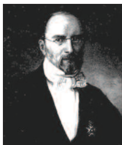
Figure 15. Carl Gustaf Mosander's research proved that yttrium and cerium, the two most abundant rare earths, actually held additional elements. Like Berzelius, Mosander studied medicine but became interested in chemistry where he made a major impact studying unusual minerals of Sweden.

03.52); the Stockholm building still exists and is used as an office building. 34