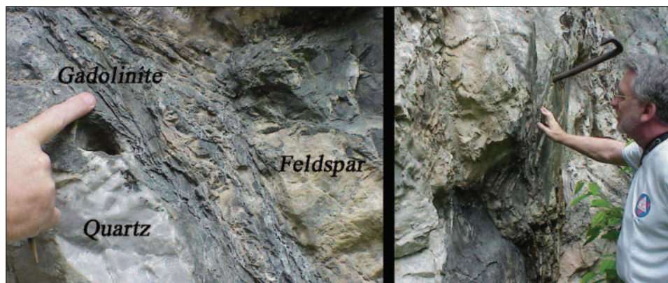
Figure 9. The entrance of the Bastnäs Mine. “Bast-näs” in Swedish means “Raffia-peninsula,” referring to the wetlands where raffia was collected in historic times and used to make baskets and even hardy skirts for hard labor. Today the wetlands about Bastnäs abound in wildflowers and strawberries and are visited by an occasional moose. The Bastnäs mine was originally an iron mine owned by Hisinger but later provided quantities of industrial cerium.

Figure 7. The Ytterby mine (N59° 25.60 E18° 21.18) has been closed off, but the surrounding rock facing (right) is typical of the pegmatite geology of the area. Pegmatites have the same composition as granite—quartz, feldspar, and mica—but the crystals are larger (left). In pegmatite outcroppings in Sweden, frequently other minerals are found, such as the gadolinite (left) in which yttrium was originally found. Historically, the quartz and feldspar were mined for the porcelain industry. Directions to reach this mine have been previously published in the 2008 Spring HEXAGON. 3*